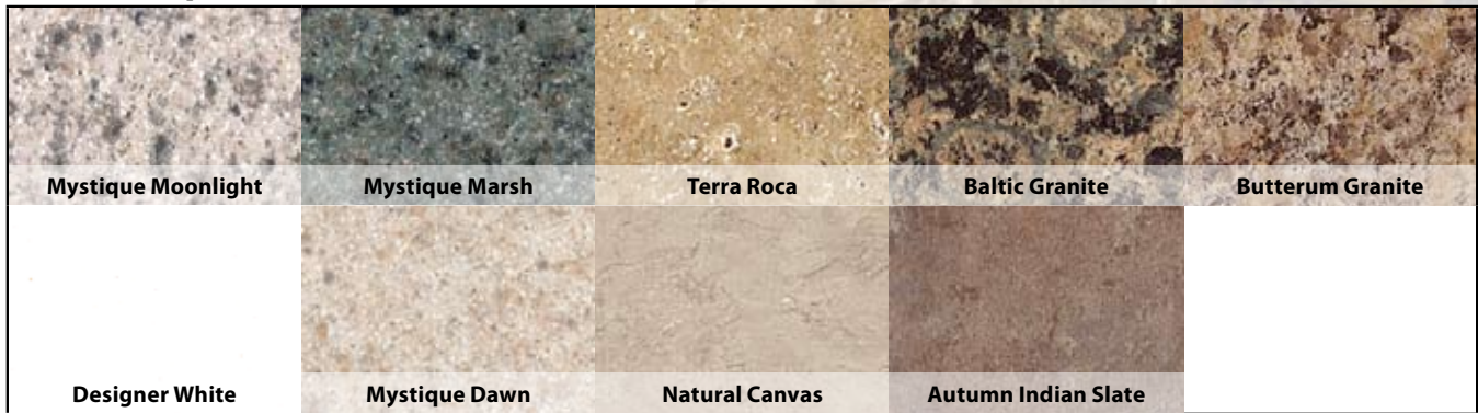
Colors available for kitchen and bath vanity.